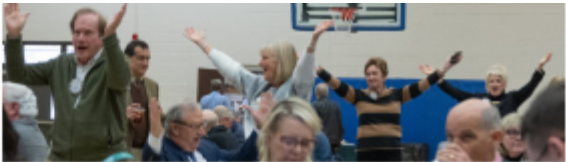
Dancing to Get the Meeting Started