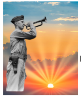
The Space Between Reville & Taps