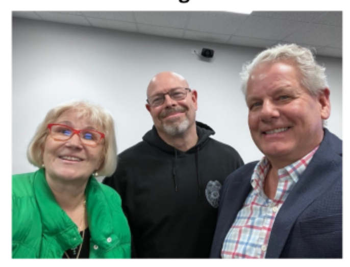
We Swept the Hooch!