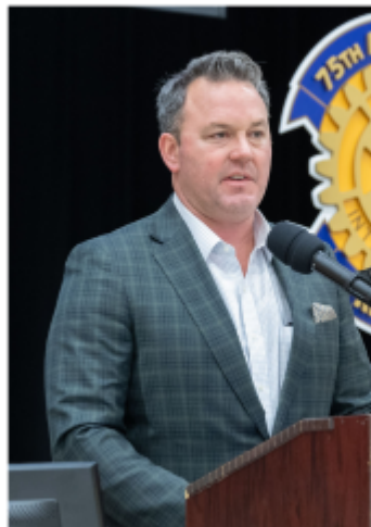
GA Lt. Gov Burt Jones