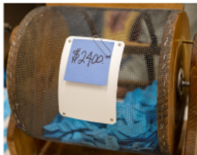
And the Winner is....