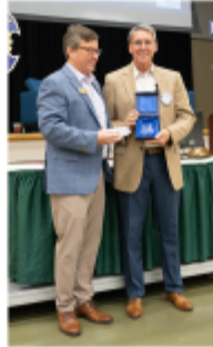
Dave Schmit Award for Foundation Giving