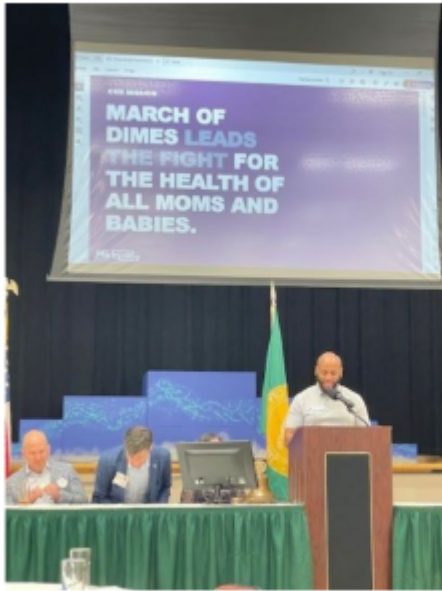
Last Week at Rotary