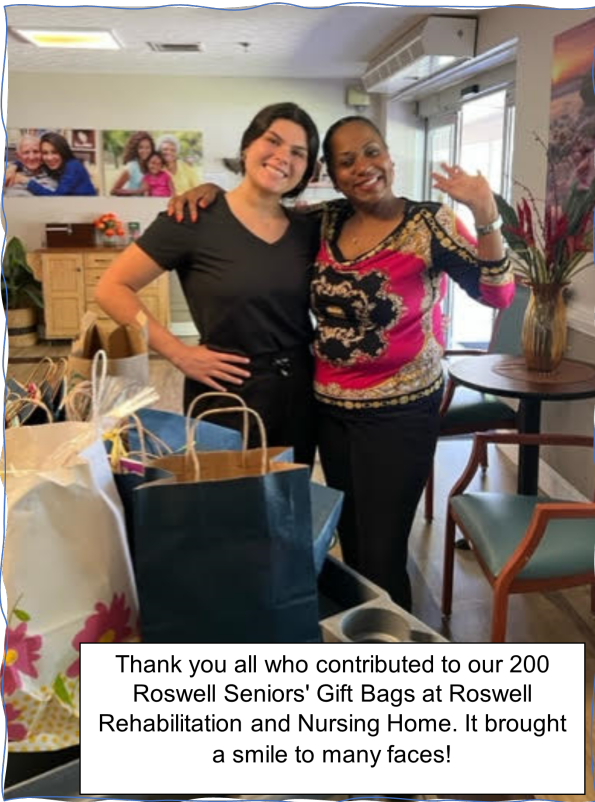
Thank you all who contributed to our 200 Roswell Seniors' Gift Bags at Roswell Rehabilitation and Nursing Home. It brought a smile to many faces!