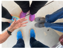
The Service Project Magician