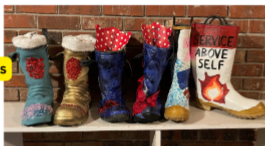
Boots for Heroes

Welcome Welcome Welcome to all who come to the Roswell Rotary meeting this Thursday for lunch. We will not only be hosting 13 of our 16 Interact Clubs but also the City of Roswell Youth Ambassadors for the Youth Day Parade on Saturday, Oct 3rd. This meeting is always inspiring and gives us the very face of hope on our stage.