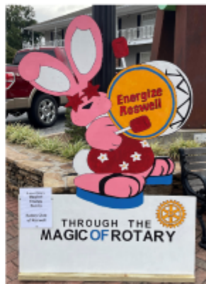
After Hours Club Roswell Rotary Club