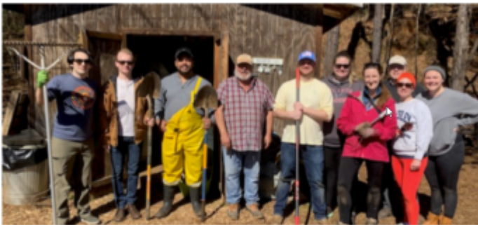
The Roswell Rotary After Hours Club working on the Unity Garden at the Chattahoochee Nature Center.