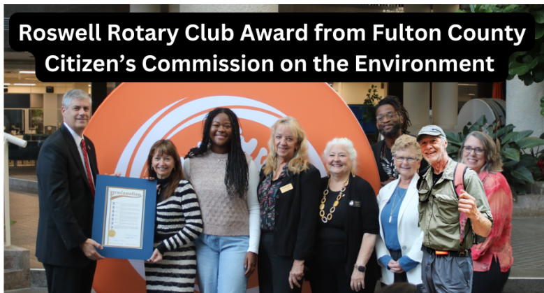
Roswell Rotary Club Award from Fulton County Citizen's Commission on the Environment