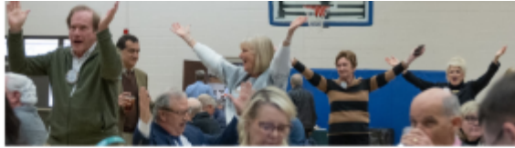
Dancing to Get the Meeting Started