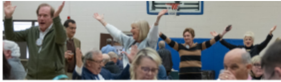
Dancing to Get the Meeting Started