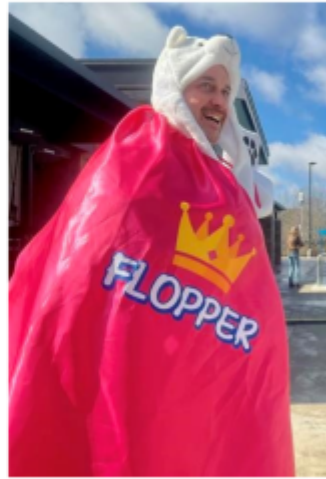
District Governor Belly Flop King at Polar Plunge