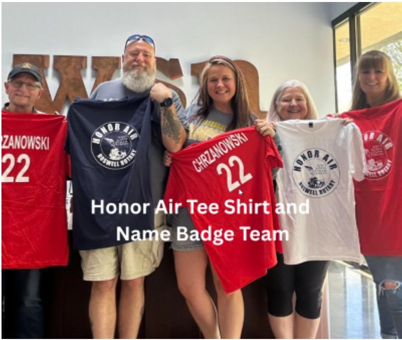
Honor Air Tee Shirt and Name Badge Team