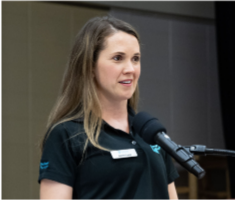
Great presentation on Parkinson's