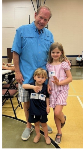
Blood Drive Buddies