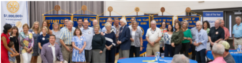
First Service Pin Ceremony 2025