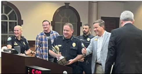
Roswell Police Dept Wins First Responder Golf Trophy for 2025