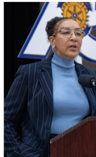
Education about Fentanyl