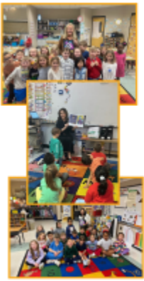
Read Across America