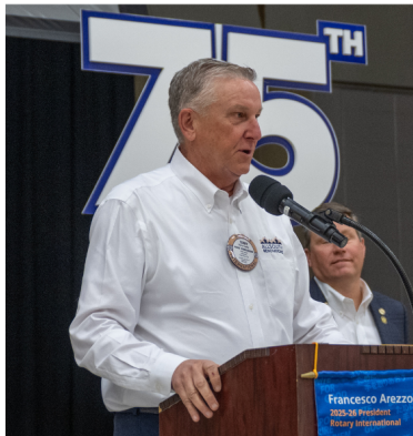
Roswell Rotary Spotlight