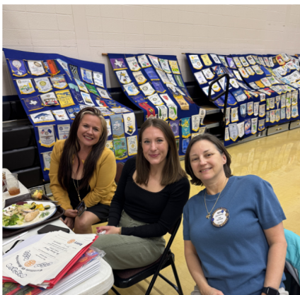
The Team That Keeps us Rolling!