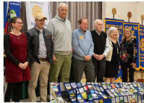
New Member Orientation