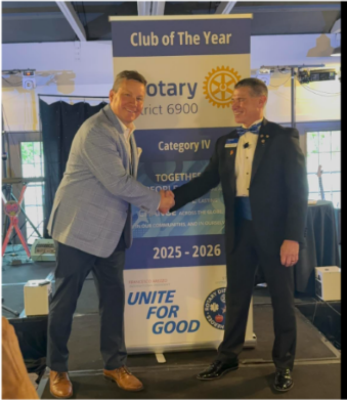
Membership-Net New Members